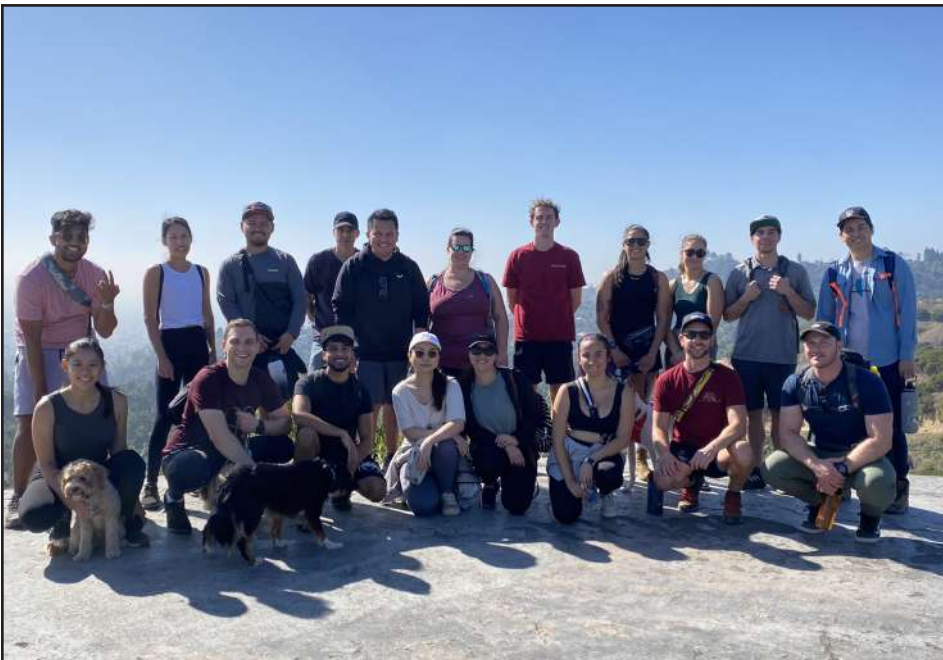
6-mile hike during the summer to Griffith Park. We had a couple detours, but we found the Hollywood sign!