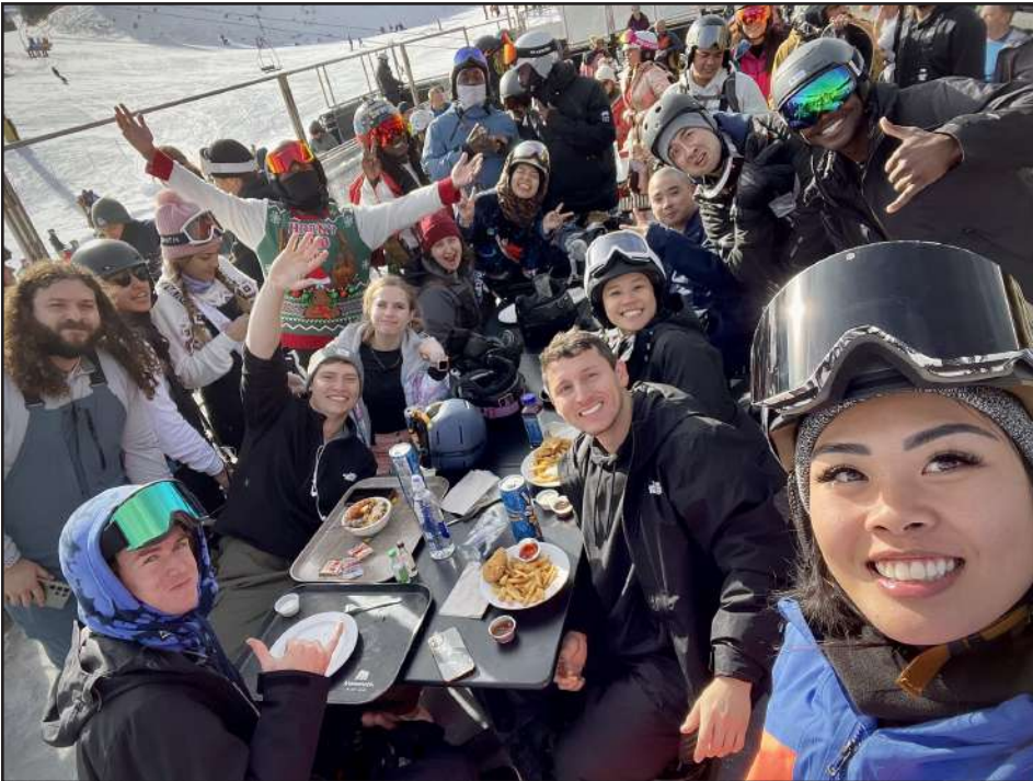
Mammoth over the Night of Lights weekend in December with 60 members.