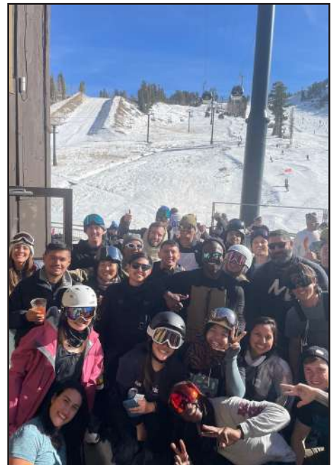
Opening Weekend with 30 members on the mountain.